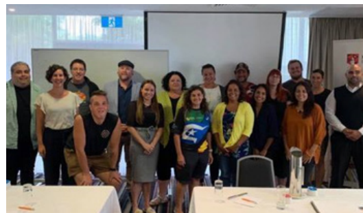
Students and facilitators at the NSW capacity-building workshops

The New South Wales State Hub held two capacity-building workshops for HDR students in 2019. The first was a Level B Workshop held at Wollongong from 21–22 February; the second, a Level C Workshop at Macquarie University in Sydney, was held on 7 August.