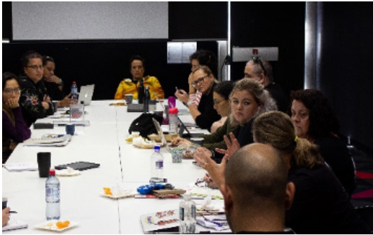
Students and facilitators at the NSW capacity-building workshops