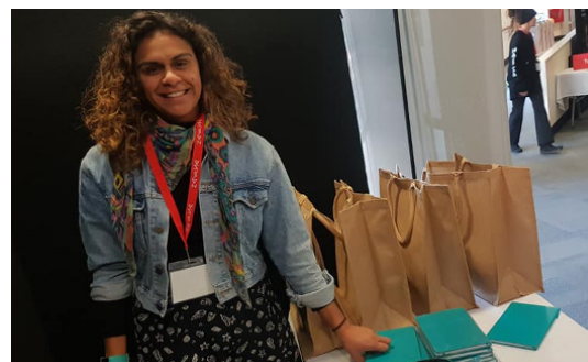
NIRAKN staff at the NIRAKN booth at the 2019 NAISA Conference

A delegate of elders and staff from NIRAKN attended the conference.