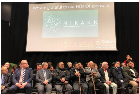
NIRAKN acknowledged at the 2019 NAISA Conference

NIRAKN is the national centre of Australian Indigenous Research expertise, knowledge and innovation, with an emerging international profile. In 2019, NIRAKN—alongside RMIT—co-sponsored the international NAISA conference in Hamilton, New Zealand, furthering NIRAKN's presence as the centre of Australian Indigenous research on the international stage. This conference provided a significant platform for NIRAKN to profile and expand their work at an international level.