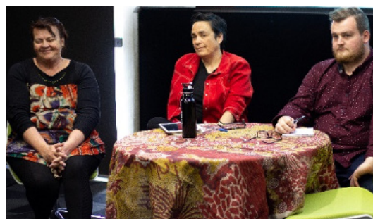
Students and facilitators at the NSW capacity-building workshops